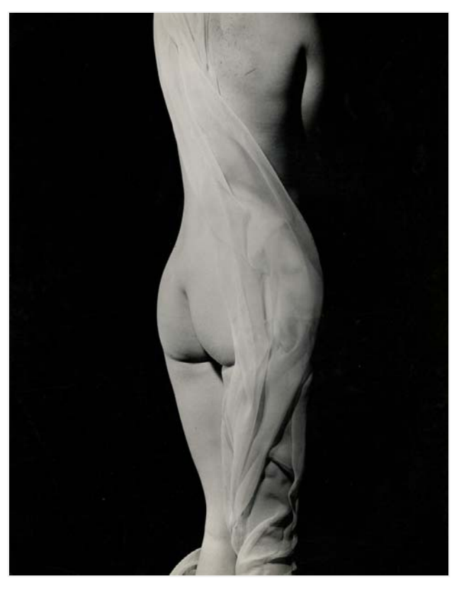
Erwin Blumenfeld (American, born Germany, 1897– 1969), "Draped Nude," 1936. Ferrotyped gelatin silver print, 13 3/8 x 10 5/8 in. Collection of Michael Mattis and Judy Hochberg.

motifs mirrored especially by Renoir and Georges Seurat. One especially clear example is <u>Seurat's paintings</u> and <u>Cartier-</u> <u>Bresson's photograph</u> of residents relaxing on the banks of the river, watching boats float by in tranquil bliss. They are almost the exact same scenes, one on canvas and the other on film.